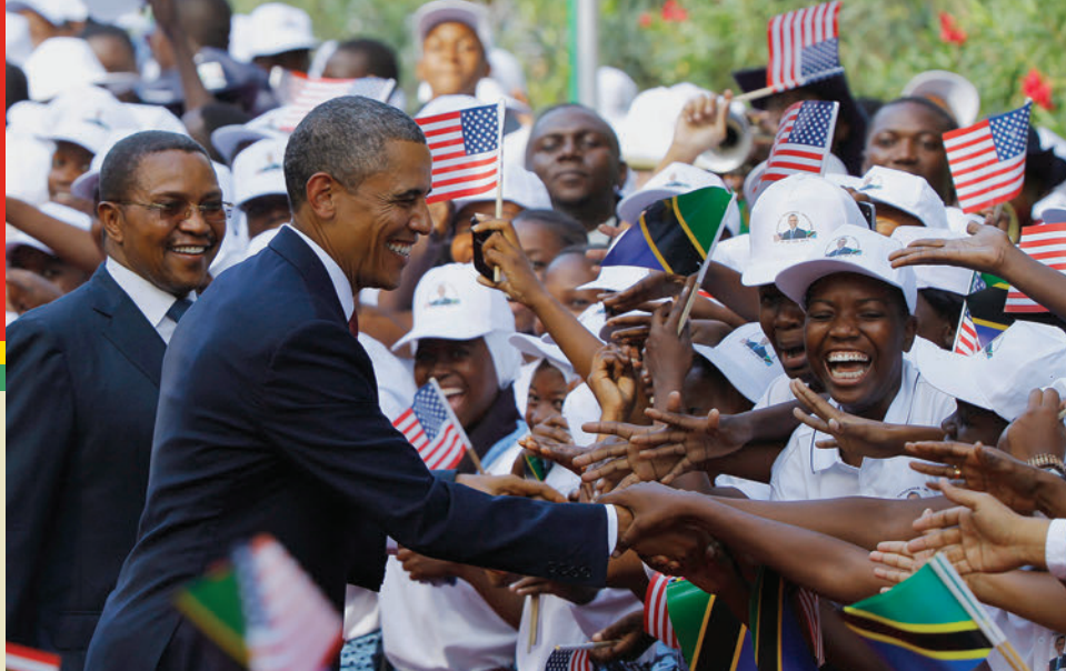
U.S. President Barack Obama and Tanzanian President Jakaya Kikwete (L) greet Tanzanians during an official welcoming ceremony in Dar Es Salaam, July 2013.