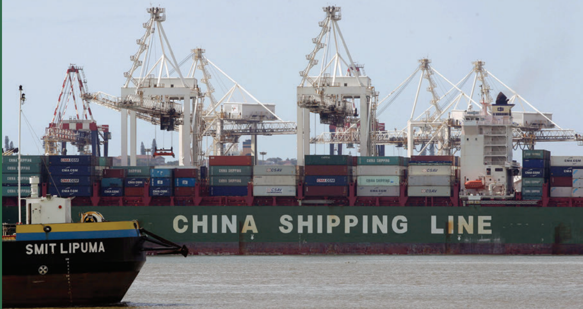
LEFT: A ship from China is loaded with containers in the port in Durban, South Africa, November 2011.